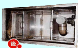
After processing oil