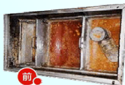
Before processing oil

Install a grease trap in your restaurant kitchen in order to properly deal with used cooking oil.